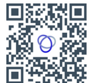
Scan for info about Blockade GC

Headquartered in Virginia, the company's 70+ scientists and engineers solve complex technical challenges and deliver efficient paths to product launch and early-stage growth.